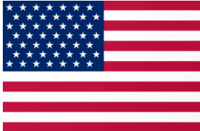
The United States of America

The Global Taskforce meets formally twice per year and commits to engaging productively with the Taskforce members and Alliance secretariat to develop coordinated actions and share information and learning in line with the agreed aims of the Taskforce.