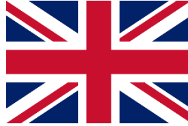
The United Kingdom