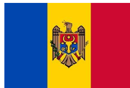
Moldova (Republic of)